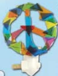
Peace Sign Night Light