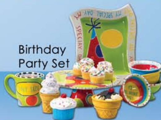
Birthday Party Set