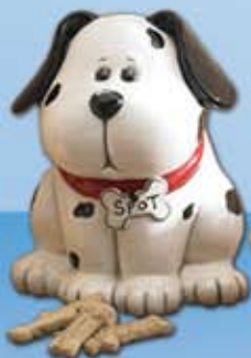
Pet Paws Project